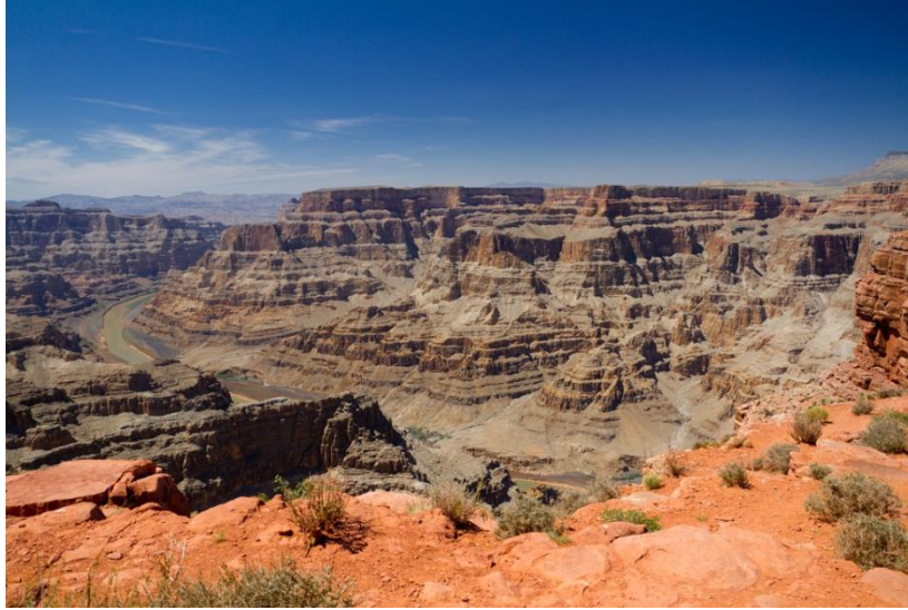
The Grand Canyon

This famous landmark is called the Grand Canyon. The Grand Canyon is located on the continent of North America. Use the internet to read all about the Grand Canyon. After you have read an ample amount of information on the topic, write a detailed paragraph about this landmark.